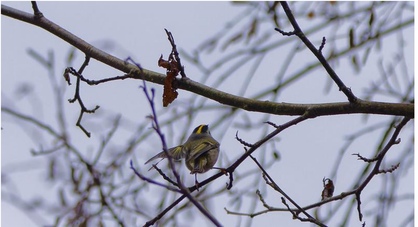
Golden Crowned Kinglet