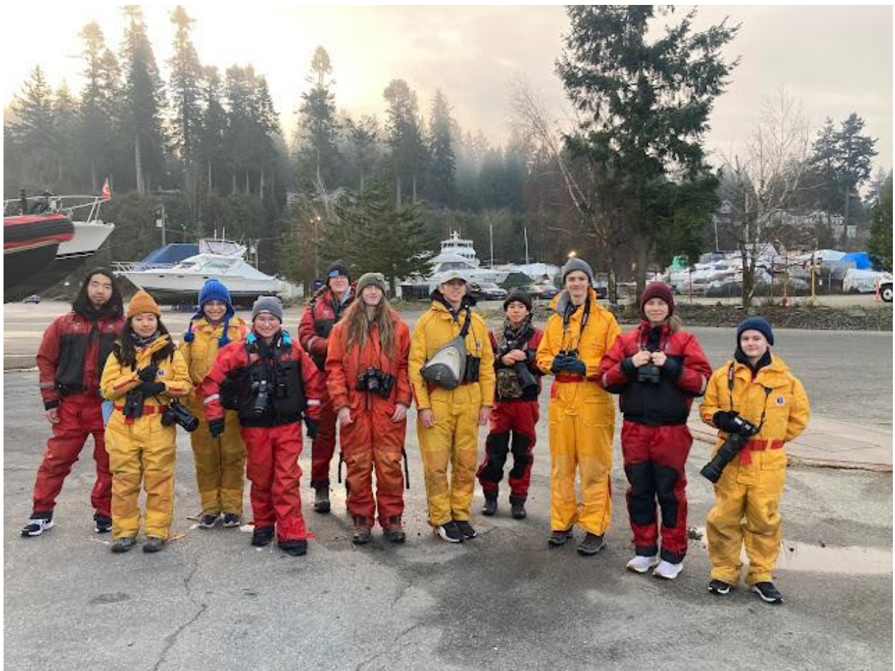
Young Birders before boarding the boat in Surrey, BC