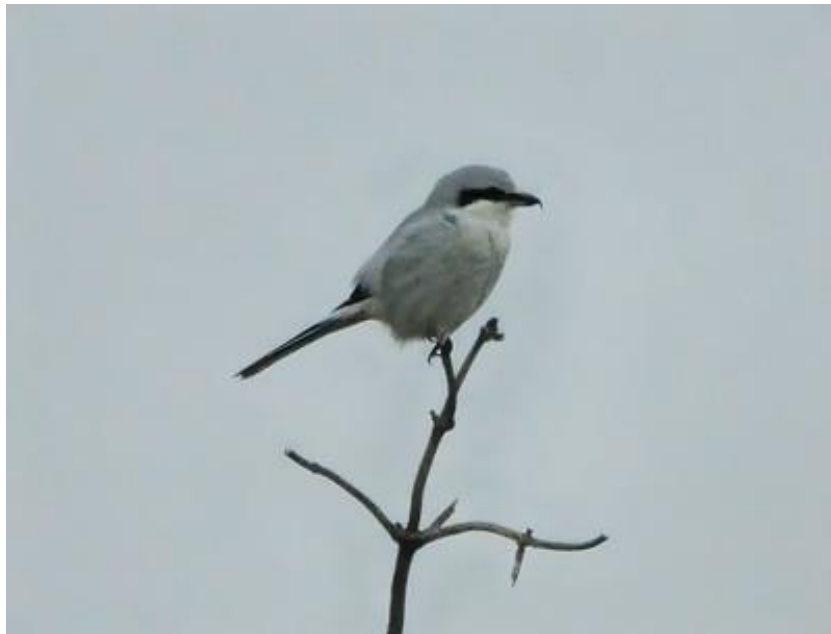
Northern Shrike Glen Bodie Brunswick Point, December '03