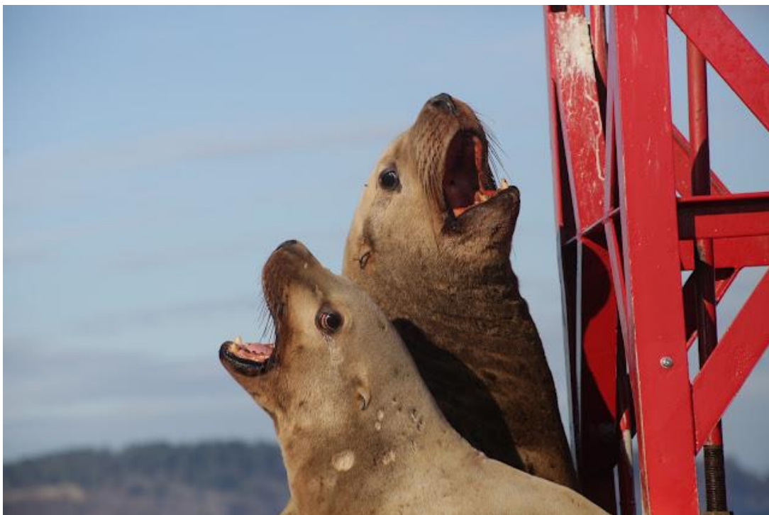
Steller's Sea Lions near Lily Point, Point Roberts-WA