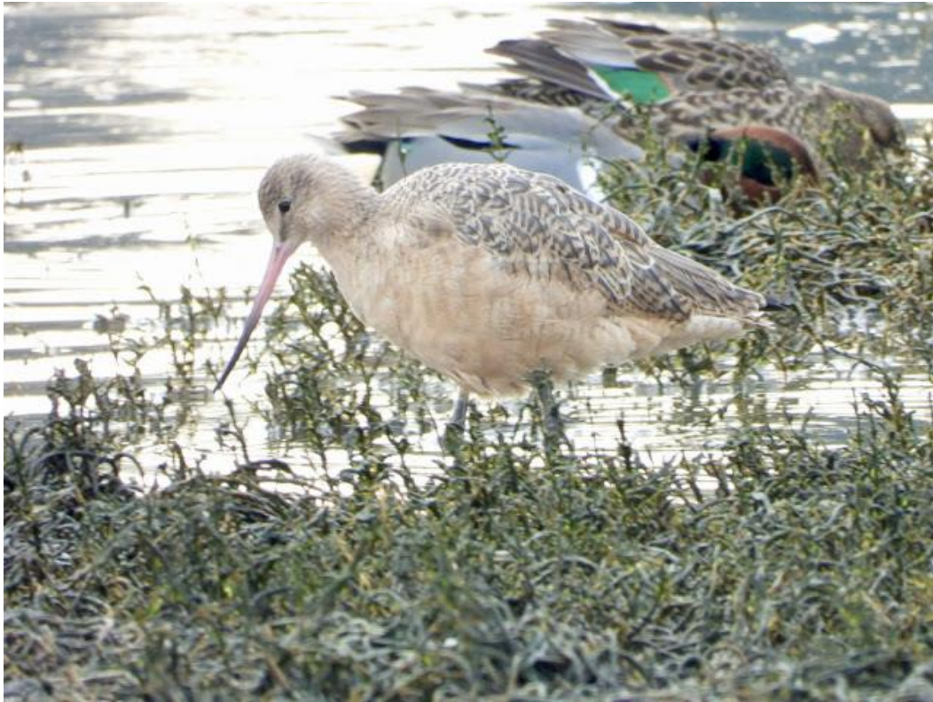
Marbled Godwit in Blackie Spit

On the way to the Tsawwassen Ferry Terminal jetty, Bentley spotted our first Ancient Murrelet, and it went flying by our boat allowing great views by all. When we reached the jetty, we had at least 600 Brandt's Cormorants sitting on the breakwater and some Black Turnstones. Nicole spotted some Red-throated Loons flying by and Bentley, Cam and Nicole spotted a Rhinoceros Auklet on the US side.