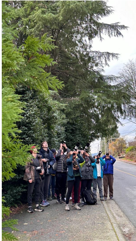
Young Birders looking up at the rare Pinyon Jay

It was so cool and unusual to see this bird here in BC. It is only the second ever record for the province.