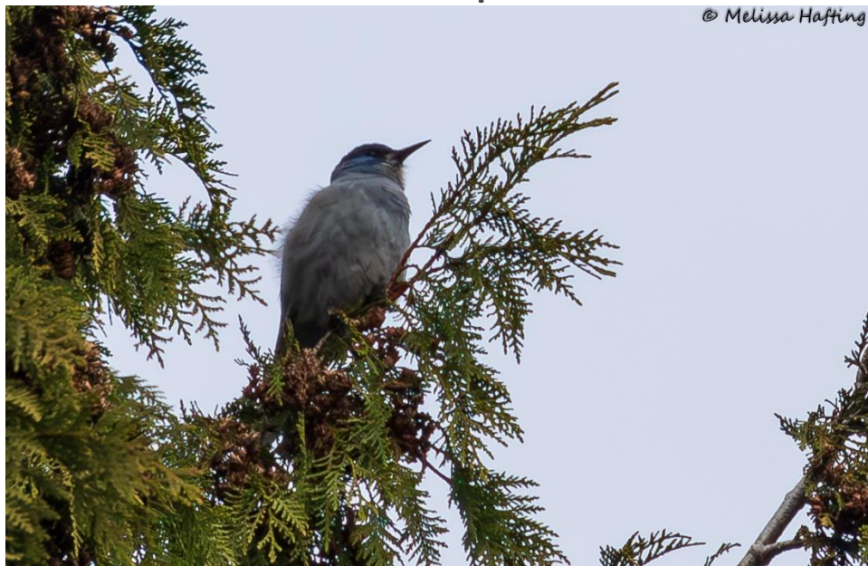
Pinyon Jay in West Van (a new BC bird for the young birders and me)

It was so cool and unusual to see this bird here in BC. It is only the second ever record for the province.